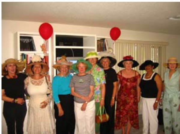
Hats and more hats were the order of the day for the Derby Day Party.

June 3, Sunday Dunedin Triathlon Honeymoon Island State Park, 7 AM