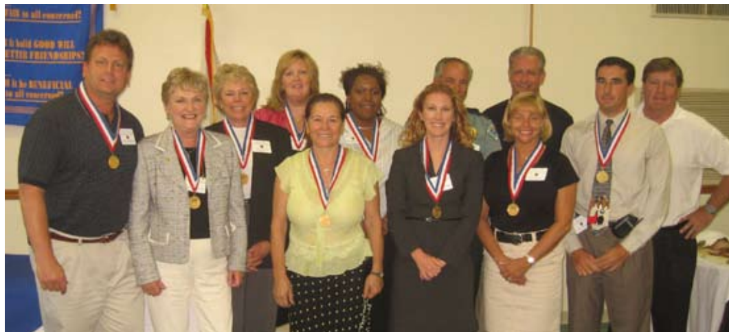
Dunedin Triathlon chairs and volunteers at last week's meeting.